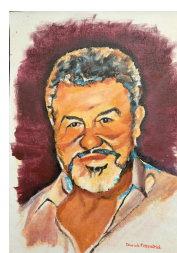
< Self Portrait Acrylic

My favourite piece of art is the Sagrada Familia by Gaudi in Barcelona. I know it is not a painting but it is incredibly original, both quirky and heroic in scale and very inspirational. Gaudi wanted the interior to be like a forest so the columns are like massive trees with branches supporting the roof. The stained glass windows do not depict any religious scene but rather are placed so as to appear like filtered sunlight coming through the leaves of the trees. I believe Gaudi was trying to create a space which was conducive to meditation and prayer and he achieved that many times over.